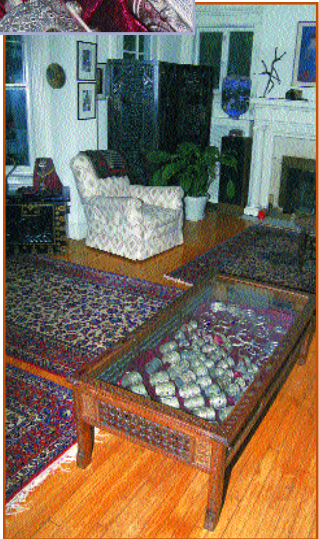
Above: LIVING ROOM, with low table made from old Egyptian mashrabyyi screens; it contains their North African silver bracelets. By the fireplace are larger mashrabyyi screens. To the left is a Zanzibarian teak chest, with Isfahan and other Middle Eastern rugs on the floor. Top left: NORTH AFRICAN SILVER BRACELETS, which includes examples from primarily Egypt, Sudan, Libya and Tunisia.